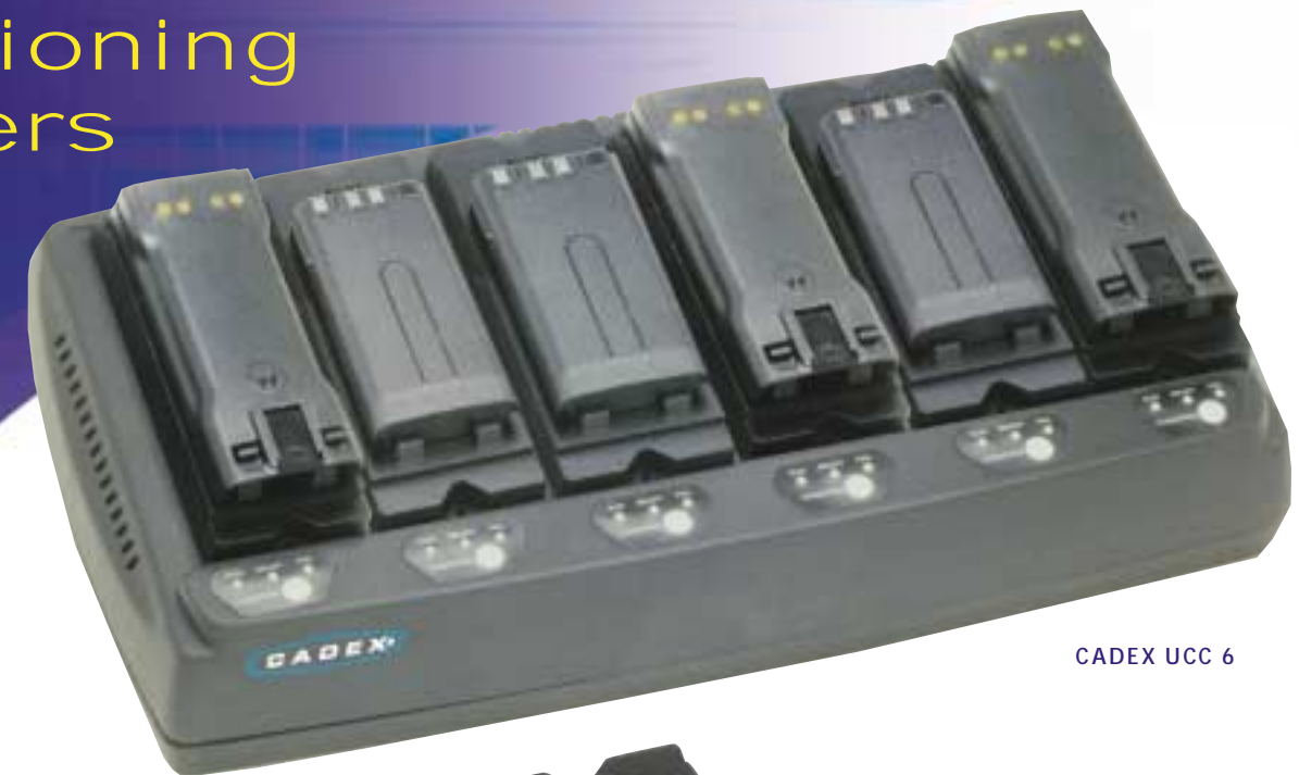
CADEX UCC 6