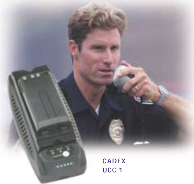
CADEX UCC 1

— Strong, hard wearing Cadex units are designed on a Universal platform to service Lithium Ion/Polymer, Nickel Cadmium and Nickel Metal Hydride batteries. Whether it's in the office, or mounted in a mobile unit, Cadex Universal Chargers offer dependable energy in any environment.