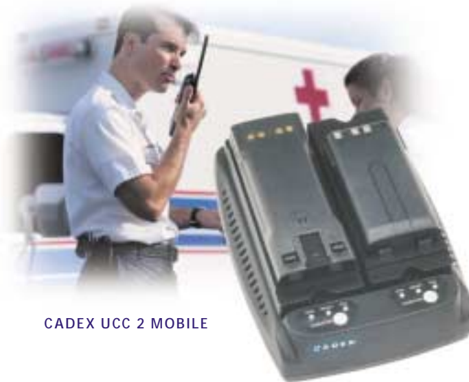
CADEX UCC 2 MOBILE