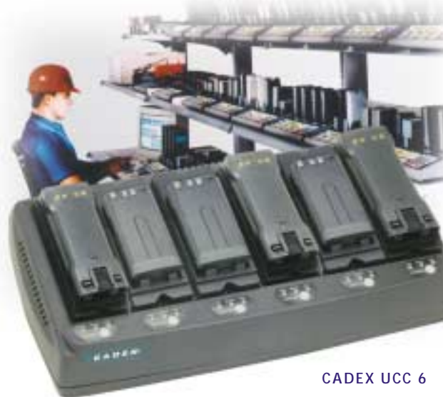
CADEX UCC 6