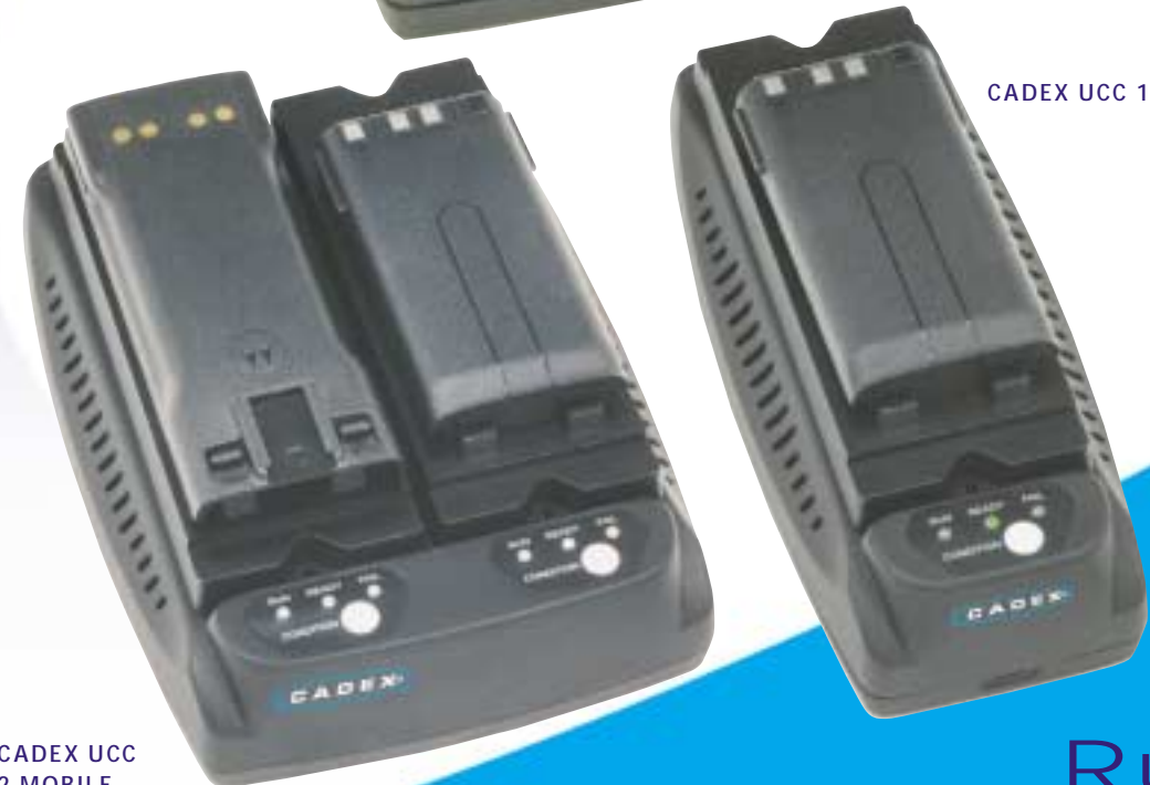
CADEX UCC 1